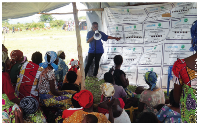
Organizations' staff explain the use and different values of coupons to beneficiaries before they enter the fair (Mutarule, South Kivu province).