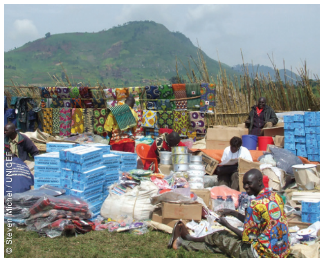
NGO workers register vendors' merchandise at the fairs to ensure quality and that no prohibited items have been brought (Aboro, Ituri province).

The NFI-Shelter Cluster actively promoted response analysis to inform programming by hosting multiple training and learning events, as well as by accompanying partners on the ground through “coaching visits”. Each year, provincial and national cluster coordinators and NGO co-facilitators conduct field visits to NFI fairs and the distribution sites of different organizations, to provide feedback and coaching on their activities. While direct distribution remains an essential part of NFI response in DR Congo, the Cluster has helped in training and supporting organizations to use the fair approach, reaching