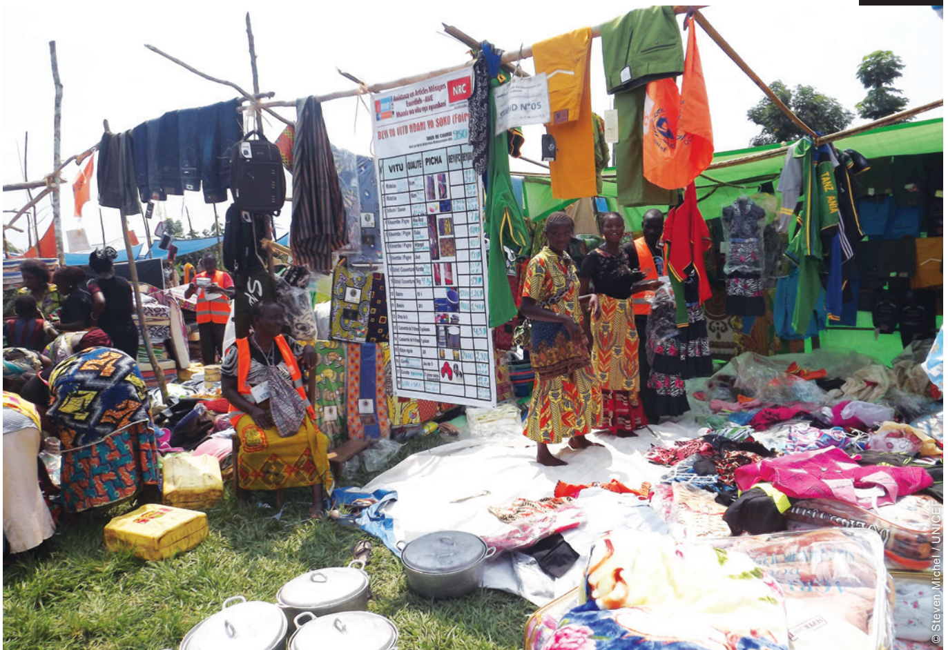
Vouchers are exchangeable at the fairs for selected NFIs, including locally made pots, clothing and blankets. Posters show photos and price ceilings of the most popular items (Mangina, North Kivu province).