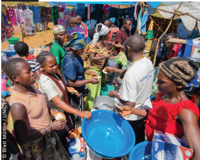
Vendors can sell multiple items based on an agreed list, and beneficiaries can haggle and discuss prices under a set ceiling (Kalele, South Kivu province).

to flashlights. Depending on the total number of families to be served, the organizing agency sets up several days of fairs in a row, with anywhere between 300 and 700 families participating each day.