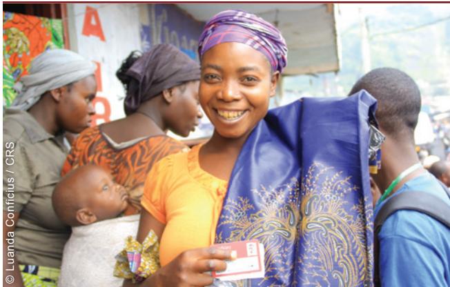
People are able to purchase pre-selected items using e-vouchers in the NFI fairs (Market of Sake, North Kivu province).